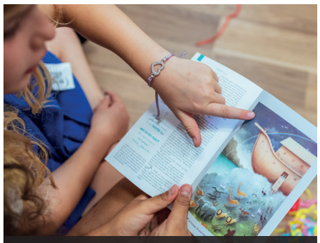
The exciting new version of the Good News Bible – Children's Rainbow Edition was produced with your support.

Bible work on our own shores is more important than ever. Your regular support means you are fighting for the gospel to be heard and doing your best to reverse our country's sad slide into secularity.