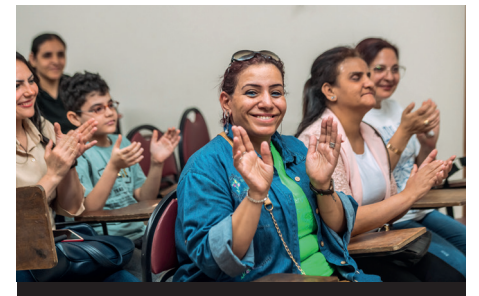
People of all ages enjoy a Bible Study in Cairo, a vibrant ministry supported by your kind giving.

'I called my son out of Egypt' (Matthew 2.15) said the evangelist Matthew, quoting the prophet Hosea. Egypt is a land of deep history and of great significance in the Bible. Christians have lived in Egypt through all the ups and downs of the last two thousand years.