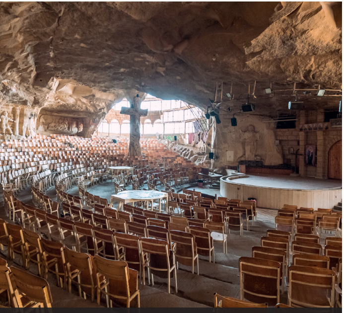
One of the Egyptian cave churches that seats thousands. Everyone who enters gets a Bible.