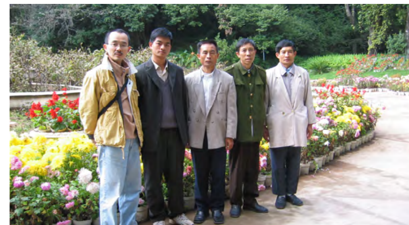
The translation team in 1995.