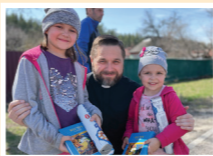
Thanks to your help, more than a million Bibles have been distributed by our colleagues in Ukraine since the war began.