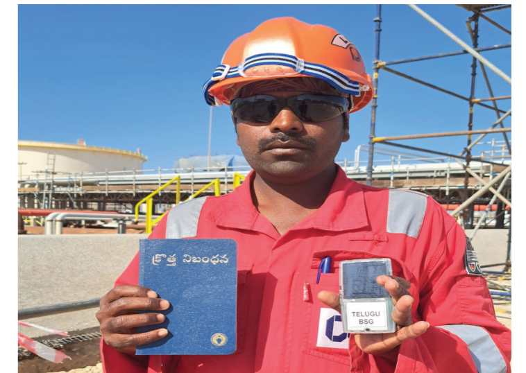
Construction workers in the Gulf are receiving Bibles and finding Jesus.