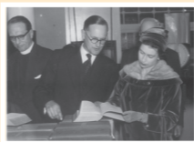
Queen Elizabeth II was our patron and in 1958 she visited us and took a look at Bibles that were about to be shipped.