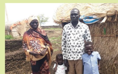
Emergency support from you was given to Bible workers like these, who have been forced out of their homes in Sudan.

and became a separate country, South Sudan. This means Sudan is 97 per cent Muslim and a tough place to be a Christian, especially since last year when tensions erupted into civil war.