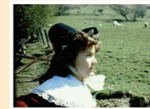
A scene from a costumed re-enactment of the life of Mary Jones.