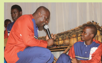
The use of Malian folk instruments for worship and witness is revolutionising people's understanding of Scripture.

Sudan is chronically unstable. In 2011 it experienced an extraordinary demographic change when its southern states, where Christians were the majority, gained independence