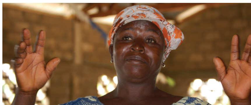
Christians who speak Kabiye love the New Testament and they're longing to read the Old Testament in their language.

Mali is Muslim-majority, has low levels of literacy and a very young