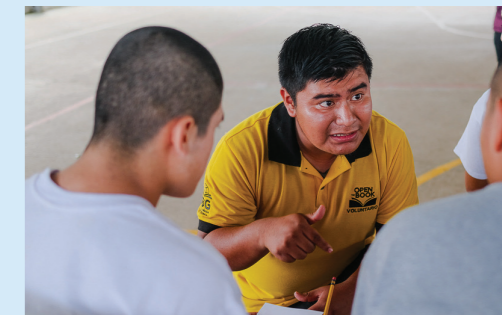
Open the Book volunteers are buoyed by your amazing support of the Bible storytelling project in Guatemala. Here detention centre inmates listen attentively to a Bible storytelling volunteer.